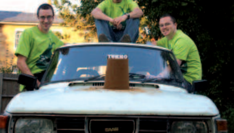
Mr Sandmen: the Sanddodgers and their car